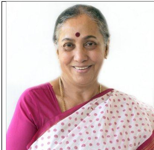
Smt. Margaret Alva Former Union Minister & Former Governor – Uttarakhand, Rajasthan, Goa and Gujarat.